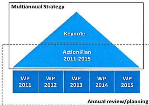
Figure 2: EUCPN's Multiannual Strategy and annual planning

The EUCPN's basic goals are reaffirmed in the Multiannual Strategy which was adopted by the Board in December 2010 for the period 2011 until the end of 2015, as shown in figure 2 below. The Multiannual Strategy 2011-2015 37 sets out the long-term orientations for the Network.